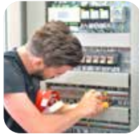
Controls and Panel Building