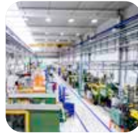
Motors, Gears and Bearings